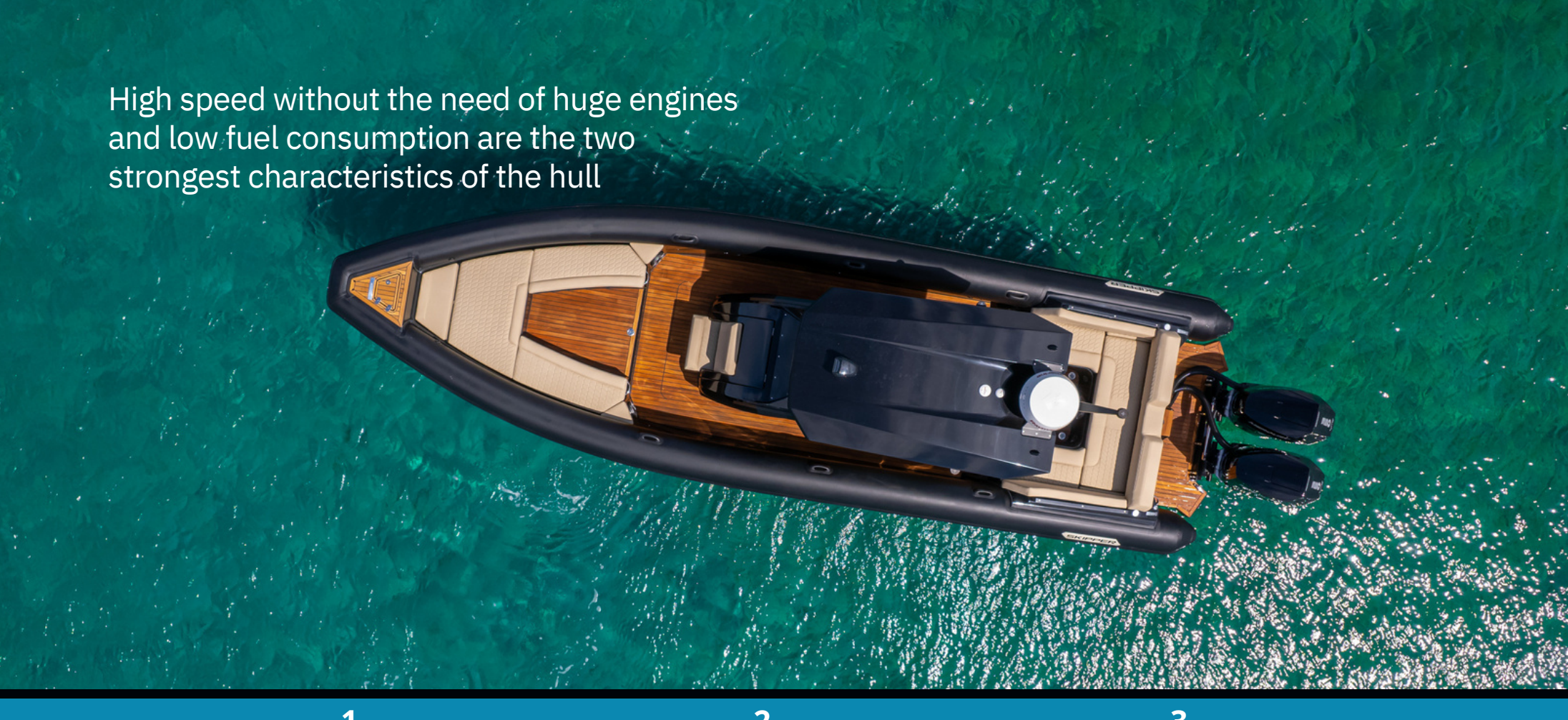
4 seats and U-Shape bench